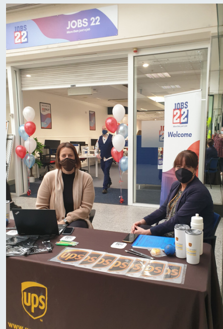
UPS exhibiting at the Jobs Fair.